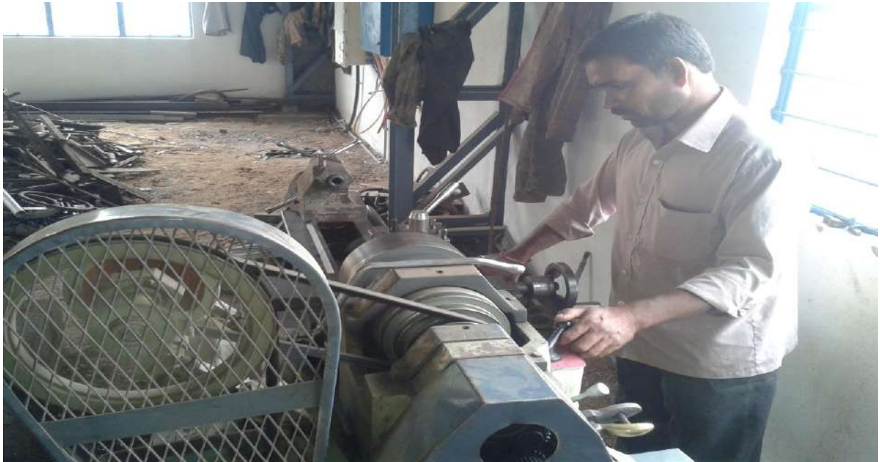
BFW MILLING MACHINE