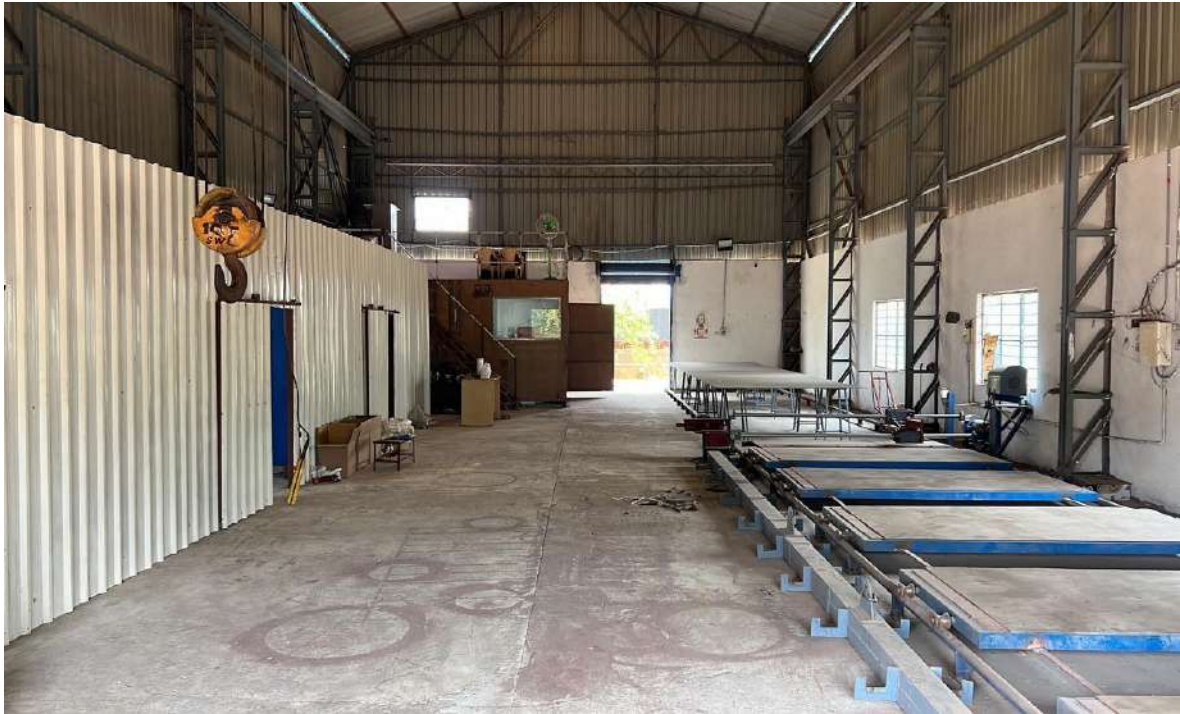
Plate Grinding Machine Indoor Setup