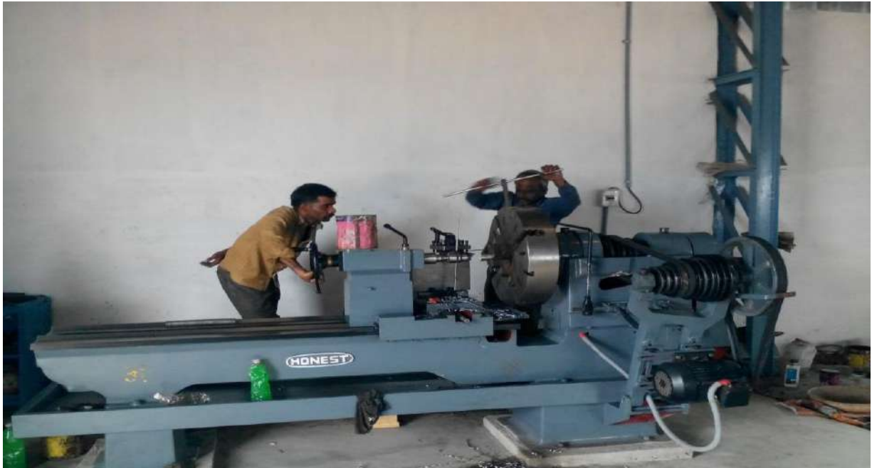
9' CENTRE HEIGHT 14" LATHE